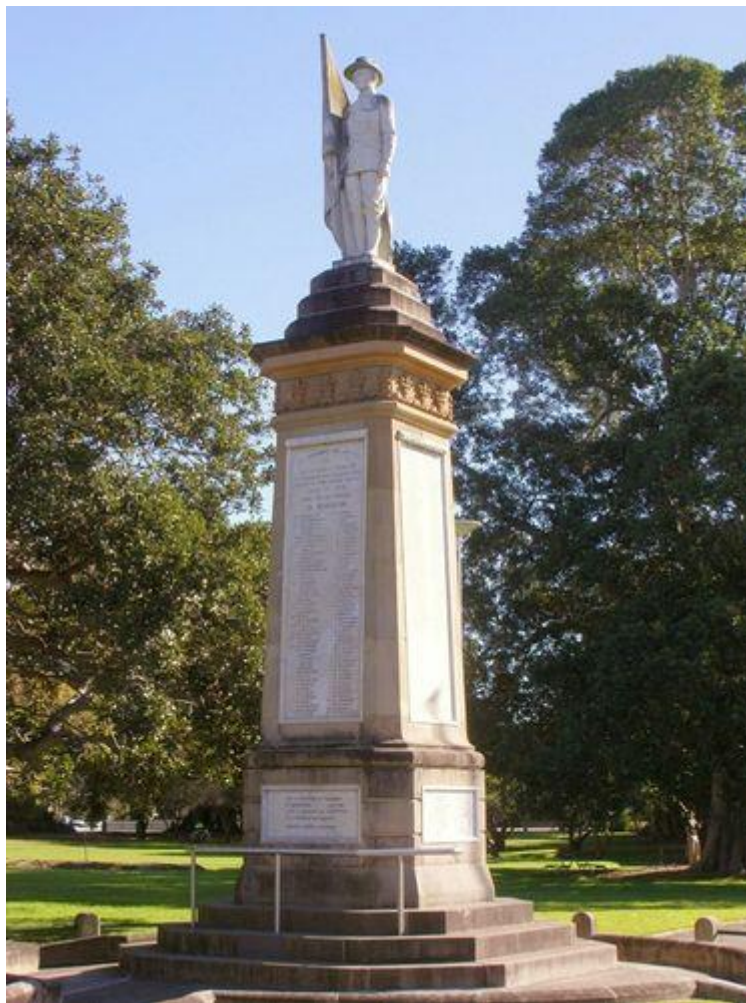
Hamilton War Memorial