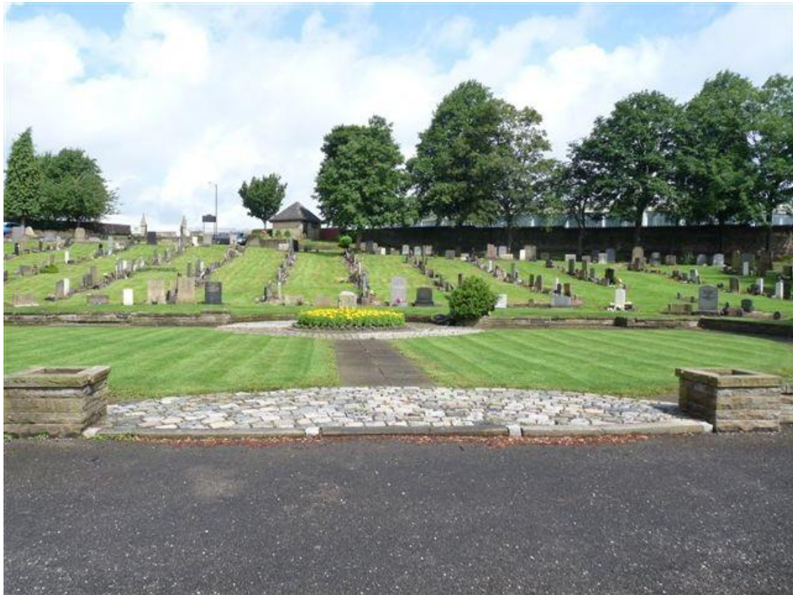
Philips Park Cemetery, Manchester, Lancashire