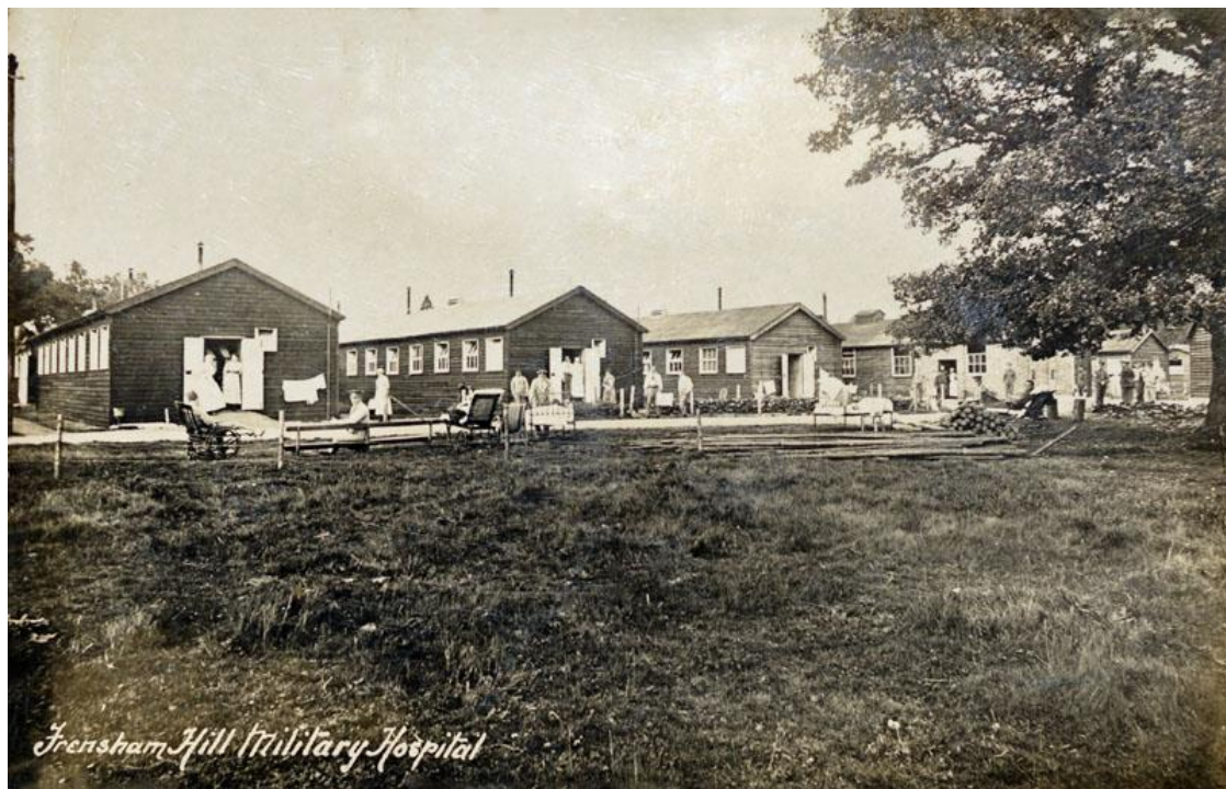
Frensham Hill Military Hospital, Farnham